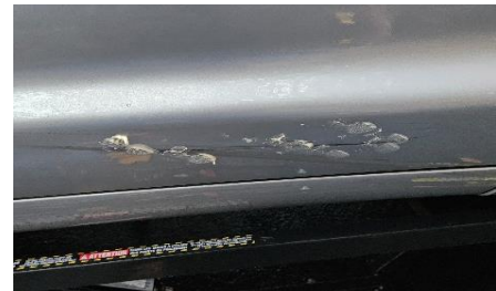
Dab the wax on the area where the scuff marks are