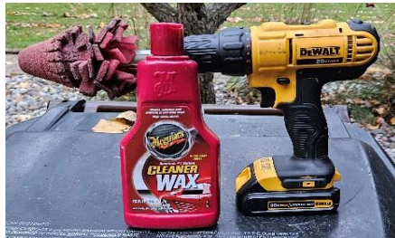
Meguiar's Cleaner Wax Mothers Power Ball (Or Cone)

As much as I would like to tell you how good of a driver I am on track days, the truth is the cones get more scared than other competitors do when I come up to the start line. Due to this, I often have cone scuff marks on my car. This is just some plastic transfer and does not hurt the finish, but sure does look unsightly for those of us who use our autocross car for other purposes than just track events. I have developed a pretty quick and easy way to remove them without too much elbow grease. Follow below for the process, the is usually 10-15 minutes for me after each event.