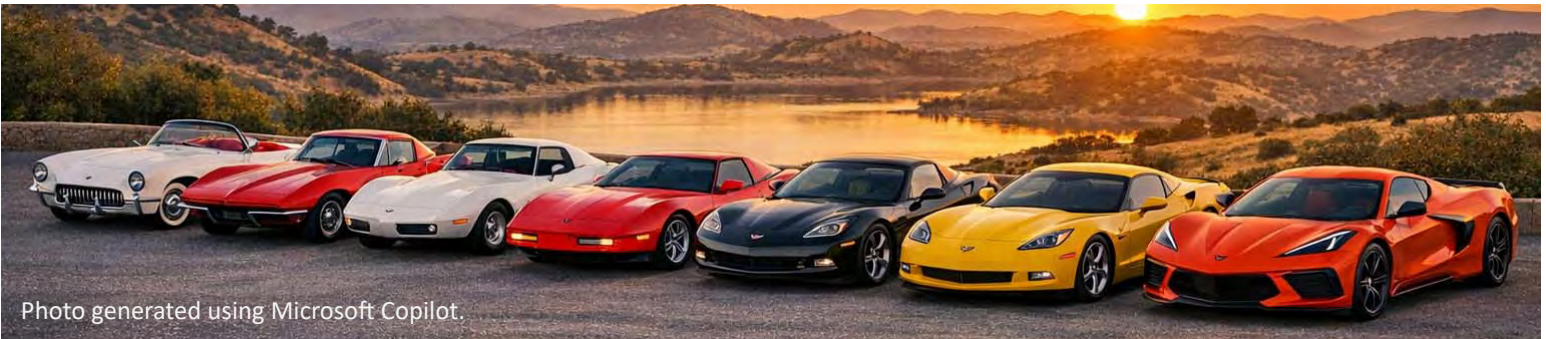
Photo generated using Microsoft Copilot.