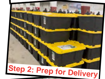
Step 2: Prep for Delivery