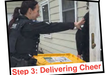
Step 3: Delivering Cheer