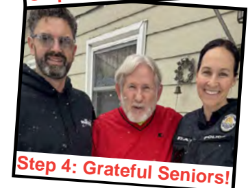
Step 4: Grateful Seniors!