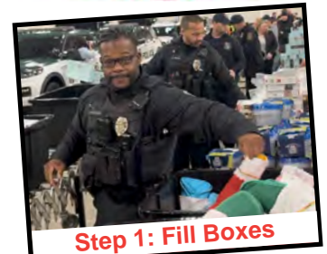
Step 1: Fill Boxes