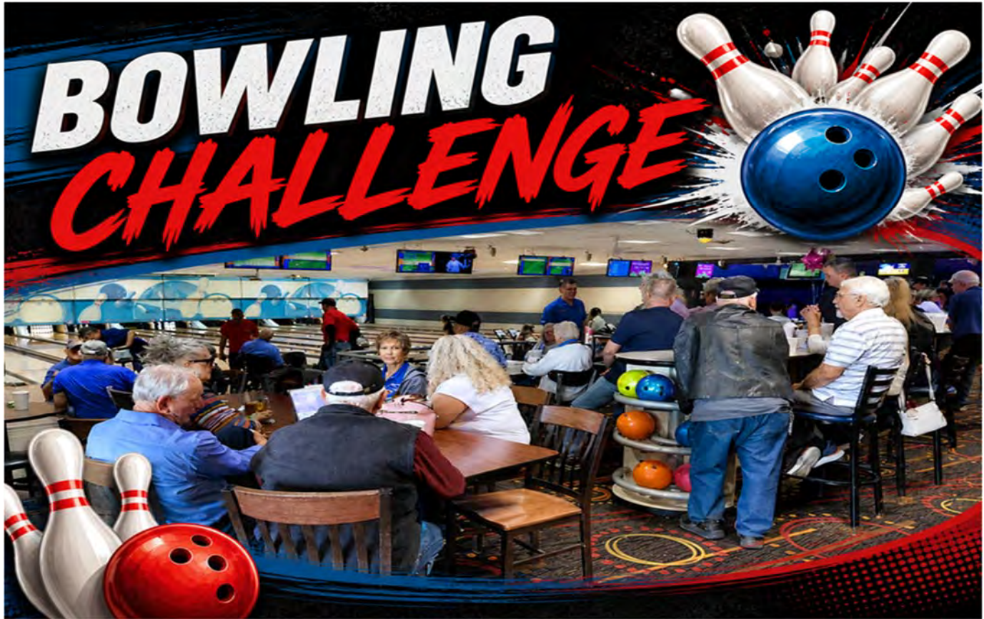
Click on the photo above to view photos of the Bowling Challenge.