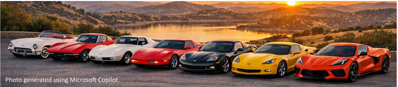
Photo generated using Microsoft Copilot.