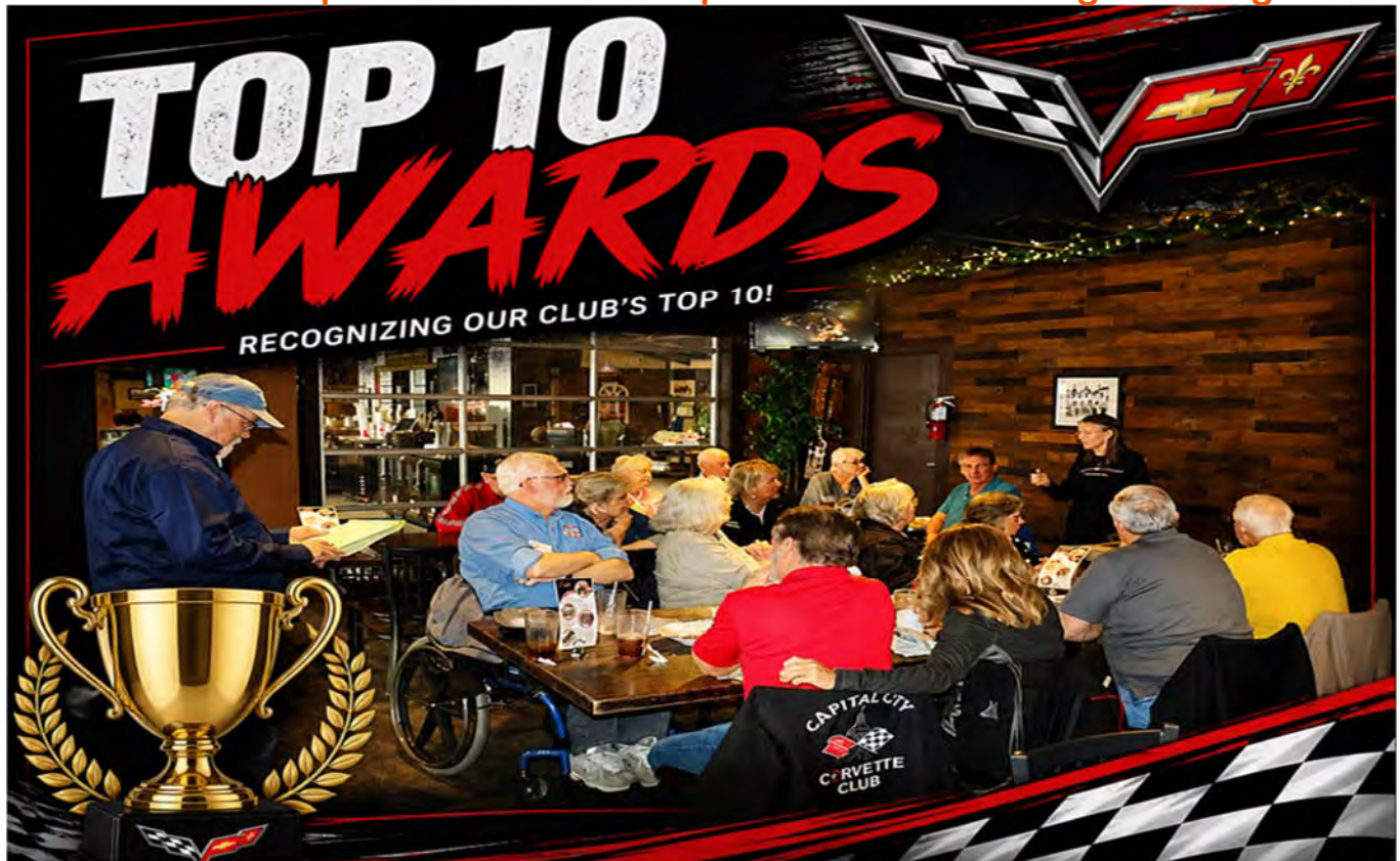
Click on the photo above to view photos from the CCC Awards Banquet.