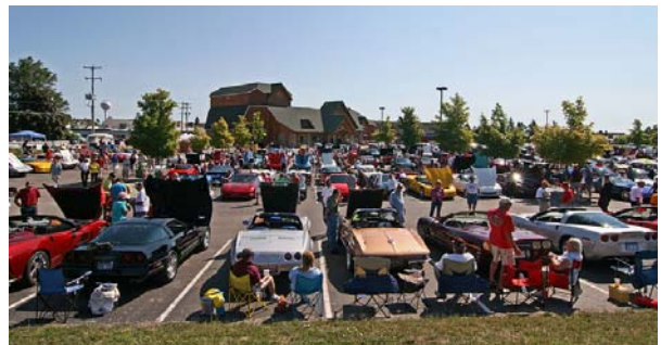
Crossroads car show

The summer getaway to Mackinaw City, MI and 26 th annual Corvette Crossroads car show is scheduled for August 21 – 23. The car show is on August 22 from 10:00AM to 2:00 PM.