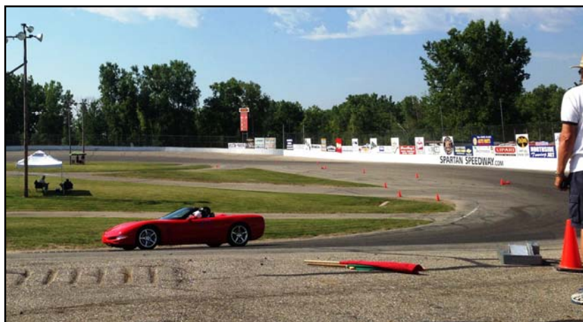
Spartan Speedway 2014 – recognize the driver and passenger – it's our Points Director and Editor!