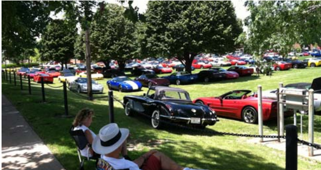
Parking at Bloomington Gold 2013

The 3 day Bloomington Gold car show, Mecum auction and swap meet in Champaign, IL is scheduled for June 27-29, 2014