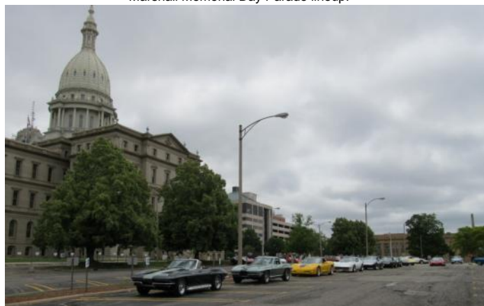
Lineup of Howard and Diana Parks Corvettes following the Capital photo shoot.