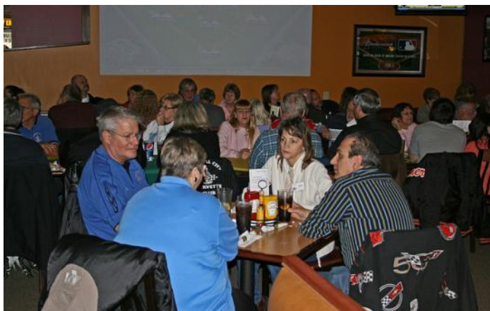
Dinner at City Limits after bowling with the Jackson Corvette Club.