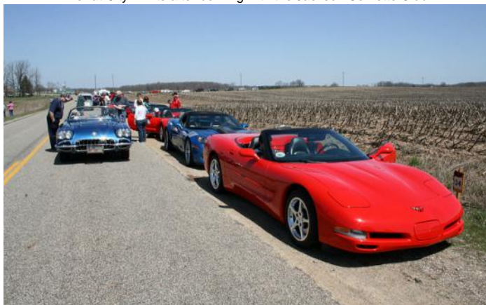
Vermontville Maple Syrup Festival Parade lineup.