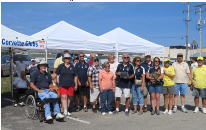
CCCC won the award for the most Corvettes entered at Corvette Crossroads.