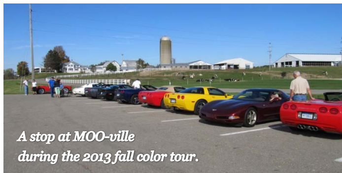
A stop at MOO-ville during the 2013 fall color tour.