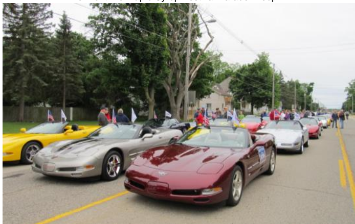
Marshall Memorial Day Parade lineup.