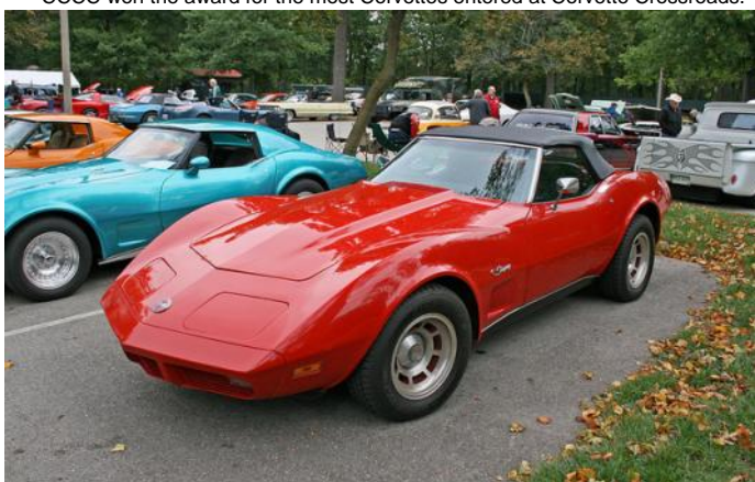
Horsepower at the Zoo.