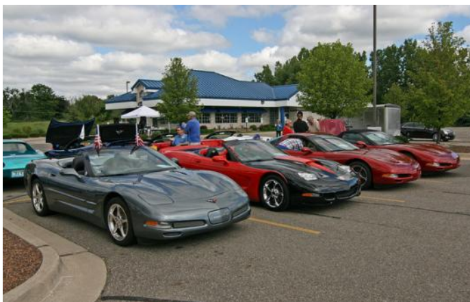
Blessing of the Vettes at Culvers in Okemos.