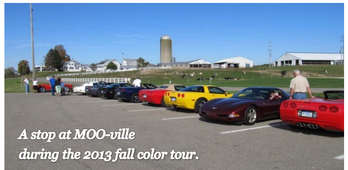
A stop at MOO-ville during the 2013 fall color tour.

It would get boring really quick if all we had going for us was one general membership meeting a month. Plan an event and let's have some more FUN!!!