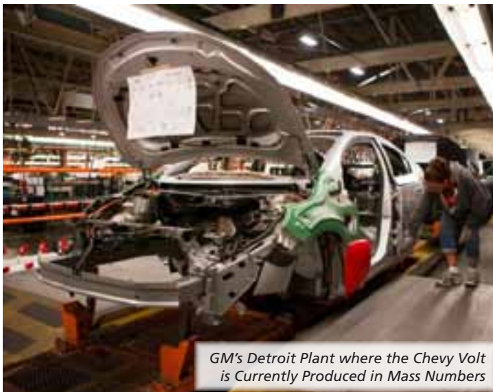
GM's Detroit Plant where the Chevy Volt is Currently Produced in Mass Numbers

However, others aren't reacting as happily to this news. Many naysayers in the automotive industry