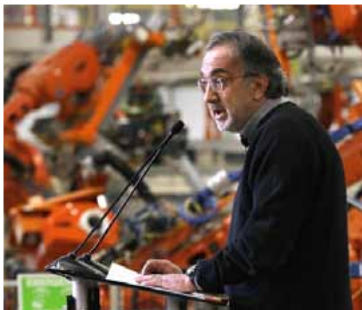
Chrysler CEO Sergio Marchionne speaking at an American plant concerning the new CAFE regulations

Of the program itself, Obama's Presidential challenger, Republican politician and former Bain CEO and Massachusetts Governor Mitt Romney branded the CAFE standards as "extreme" and claimed that they "hurt domestic automakers and provide a benefit to some of the foreign automakers". Of the diversification by automakers in to the Electric market and the development of the electric vehicle as a viable alternative, Romney says that the electric vehicle is "a technology that people aren't interested in" and that if elected he would work to repeal the CAFE standards. His side also argues that repealing of CAFE, when coupled with the removal of oil drilling regulations, would result in the creation of "millions of jobs", but have not provided any evidence to support the claim of millions or to provide a hard number, outside of the some 14,000 lost in that industry since 2008 being rehired.