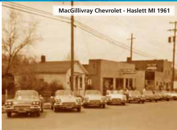
MacGillivray Chevrolet - Haslett MI 1961