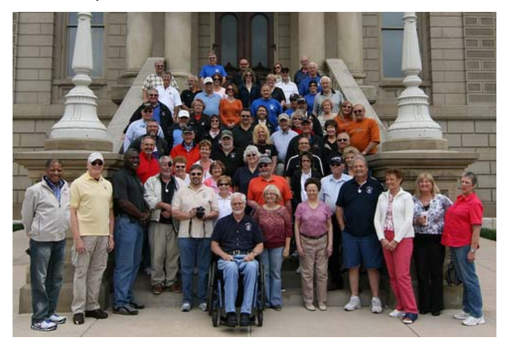
(This article was also published in the Summer 2013 edition of Blue Bars.)

The Capital City Corvette Club has touched many lives in the past fifty five years. Its current members look forward to continuing our rich legacy of friendships, service and the enjoyment of Corvette ownership.