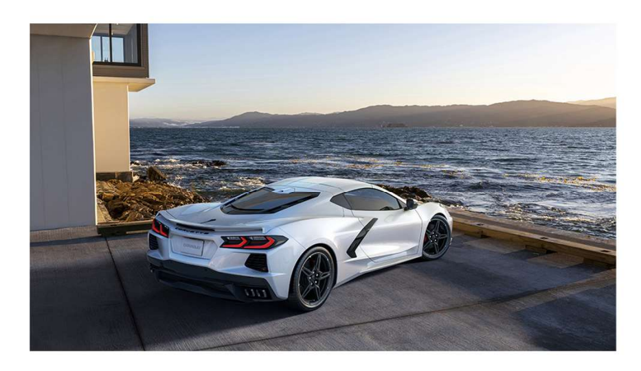
2022 Chevrolet C8 Corvette Stingray Chevrolet

suggesting that electric motor will be responsible for an additional 160 hp or so. Thanks to the "e-booster," the E-Ray won't produce any emissions until it tops 35 mph. The motor could also improve its already impressive 2.8-seconds zero to 60 mph time, too.