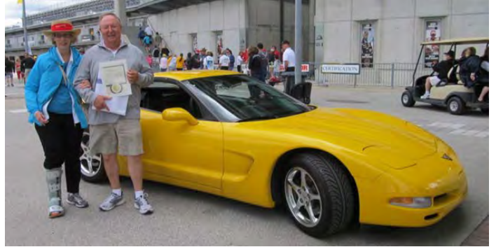
More info at http://www.bloomingtongold.com/

The 3 day Bloomington Gold NCCC car judging and road tour takes place June 23-25 at the Indy 500 raceway in Indianapolis.