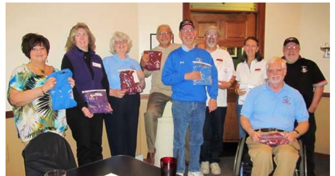
Top Ten Banquet