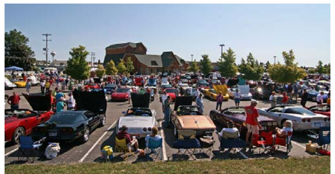
Crossroads car show

The summer getaway to Mackinaw City, MI and 26 th annual Corvette Crossroads car show is scheduled for August 21 – 23. The car show is on August 22 from 10:00AM to 2:00 PM.