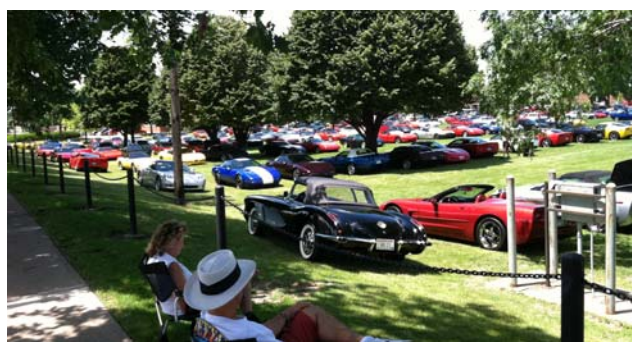
Parking at Bloomington Gold 2013

The 3 day Bloomington Gold car show, Mecum auction and swap meet in Champaign, IL is scheduled for June 27-29, 2014