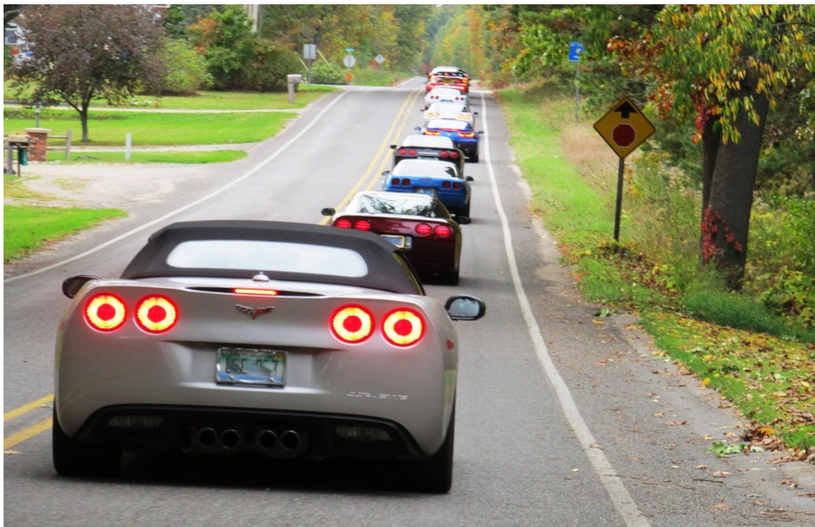
2013 Fall Color Tour

It's as simple as that. We are always looking for folks to host or chair an event, so take the plunge; it can be a fun and a rewarding experience. Plus you get points!