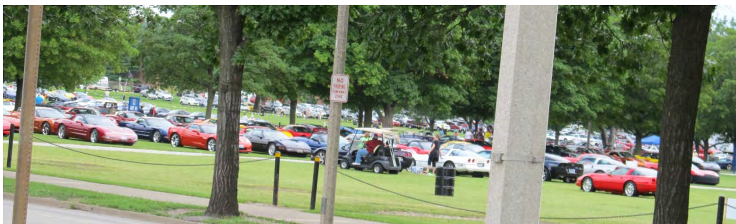
Bloomington Gold - 2013