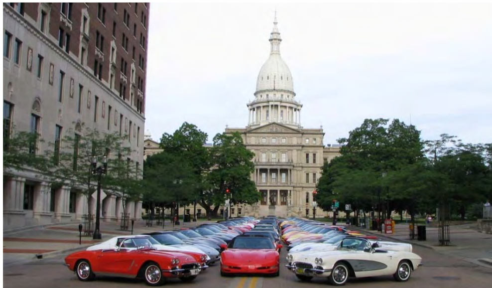
Chevrolet Trademark(s) used with the written permission of General Motors.

Submit newsletter articles to 4c.board@cccorvette.org by the 24 th of each month.